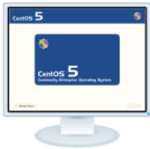
Design Templates (800x600 pixels)