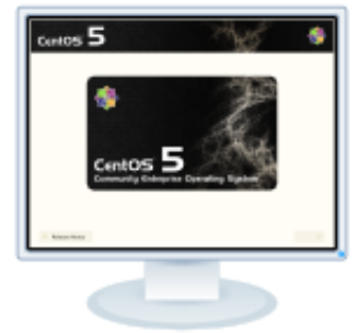
Final design used as based to produce PNG images.