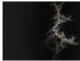
Anaconda background image (800x600.png) holding CentOS Default Artistic Motif.