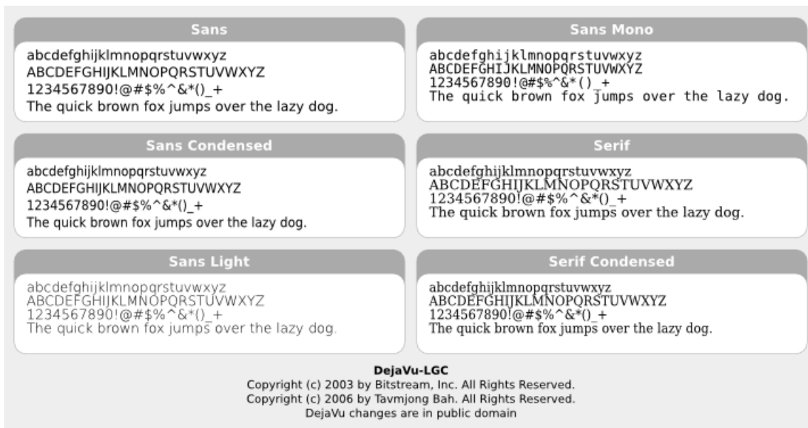
Figure 2.5: DejaVu-LGC font-family.

The CentOS Project Corporate Identity is attached to ‘DejaVu LGC’ font-family and ‘Denmark’ font-family.