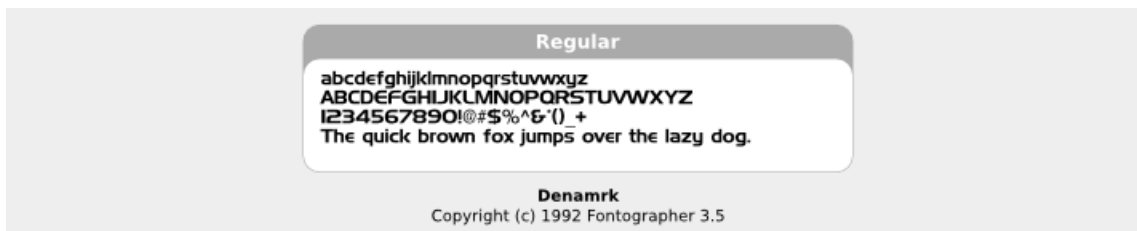
Figure 2.6: Denmark font-family.

Caution The copyright and license of ‘Denmark’ typography aren’t very specific and that issue may represent a threat to The CentOS Project Corporate Identity.