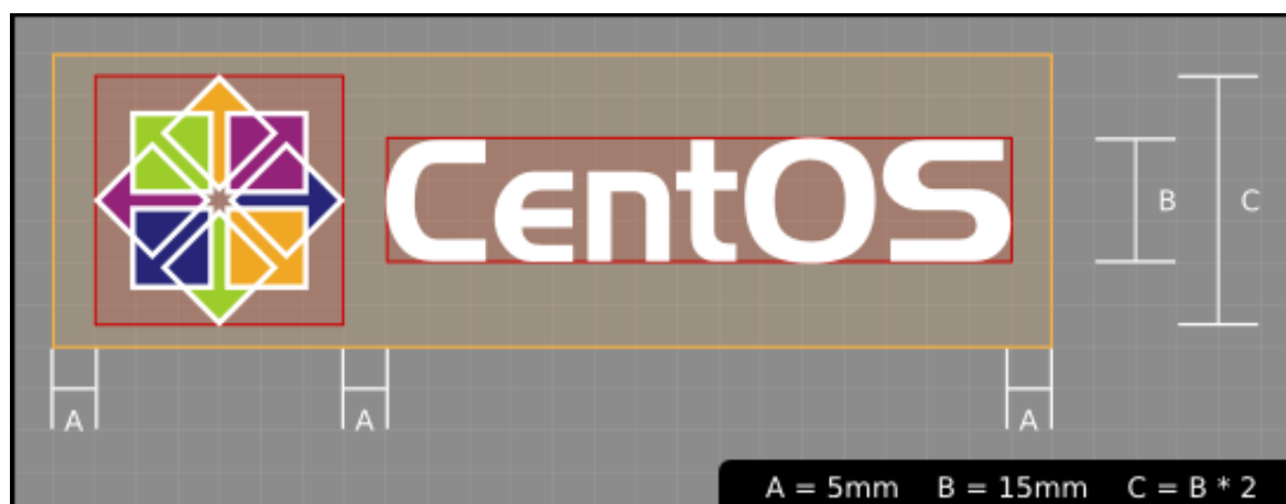
Figure 2.7: The CentOS logo construction

When the CentOS release brand is built, use ‘Denmark’ typography for the release number. The release number size is two times larger (in height) than default ‘CentOS’ word. The separation between release number and ‘CentOS’ word is twice the size in points of separation between ‘CentOS’ word and phrase ‘Community Enterprise Operating System’.