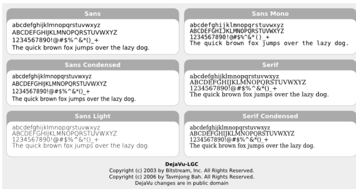
Figure 2.5: DejaVu-LGC font-family.

The CentOS Project Corporate Identity is attached to ‘DejaVu LGC’ font-family and ‘Denmark’ font-family.