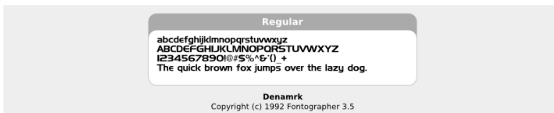
Figure 2.6: Denmark font-family.

Caution The copyright and license of ‘Denmark’ typography aren’t very specific and that issue may represent a threat to The CentOS Project Corporate Identity.